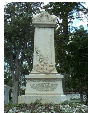
"Erected to Keep in Tender Remembrance"