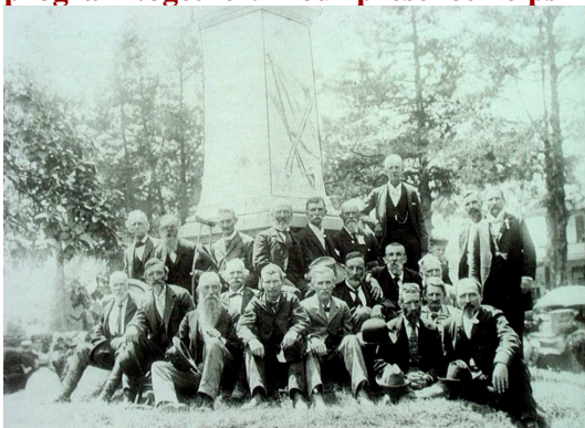
Powhatan Troop reunion, July 1896

Please join us this year in not only honoring the Powhatan Troop but your Confederate ancestors and your Southern Heritage as well. As past Commander, I know first hand how much effort that it requires to put this program together. Your presence helps make this event a success.