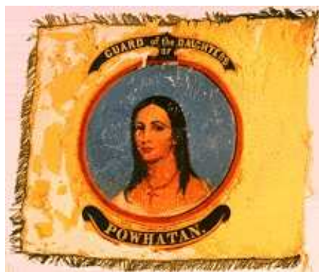
Powhatan Troop Flag